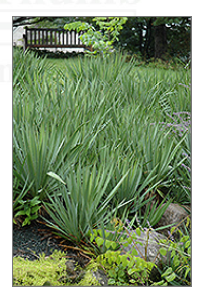
Adam's Needle