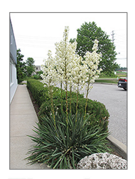
Adam's Needle in bloom