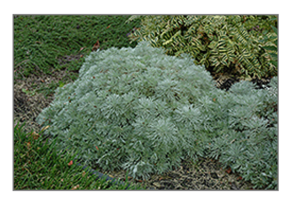
Silver Mound Artemisia

This is a relatively low maintenance plant, and should be cut back in late fall in preparation for winter. Deer don't particularly care for this plant and will usually leave it alone in favor of tastier treats. It has no significant negative characteristics.