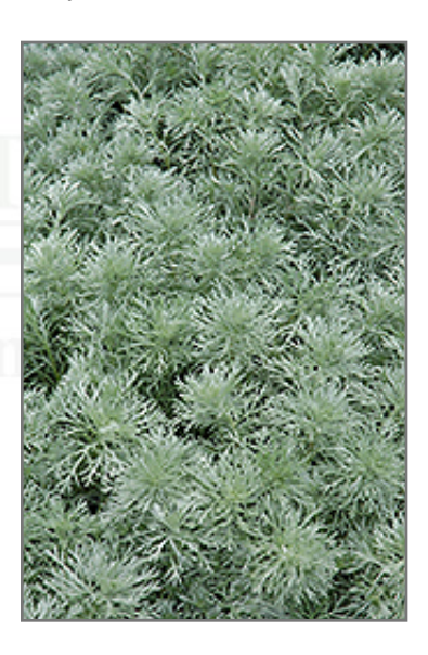
Silver Mound Artemisia foliage

Silver Mound Artemisia is recommended for the following landscape applications;