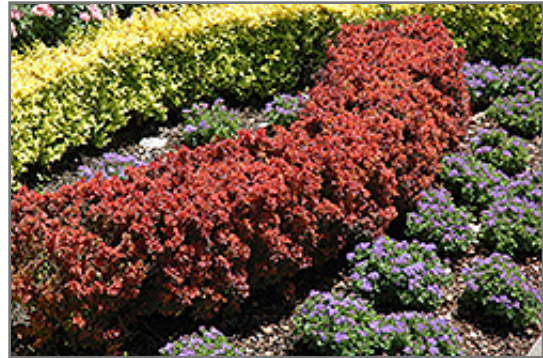
Royal Burgundy Japanese Barberry