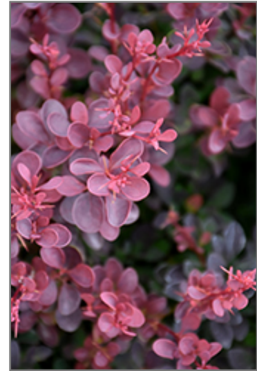
Royal Burgundy Japanese Barberry foliage

Royal Burgundy Japanese Barberry is a dense multi-stemmed deciduous shrub with a mounded form. It lends an extremely fine and delicate texture to the landscape composition which should be used to full effect.