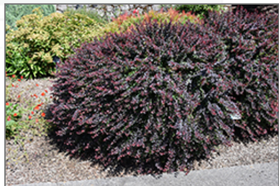
Royal Burgundy Japanese Barberry