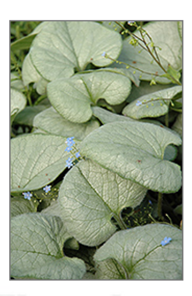
Looking Glass Bugloss foliage

Silver heart shaped foliage create a unique addition to containers, borders and garden landscapes; a shade loving mounded variety that is easy to grow, requiring little to no maintenance; sky blue flowers emerge during the late spring months