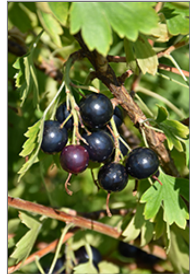
Crandall Clove Currant fruit