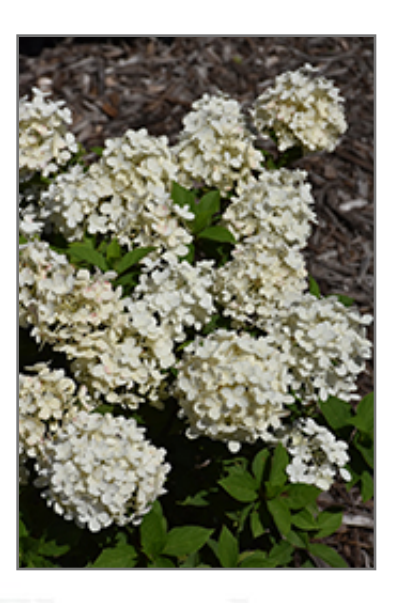
Tiny Quick Fire Hydrangea flowers