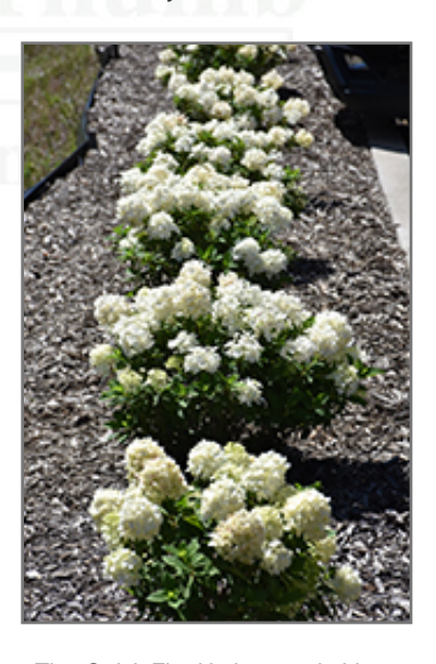
Tiny Quick Fire Hydrangea in bloom