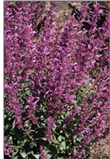
Meant to Bee Royal Raspberry Hyssop flowers

Meant to Bee Royal Raspberry Hyssop is an open herbaceous perennial with an upright spreading habit of growth. Its relatively fine texture sets it apart from other garden plants with less refined foliage.