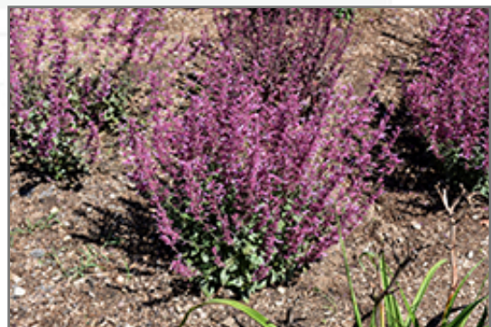
Meant to Bee Royal Raspberry Hyssop in bloom