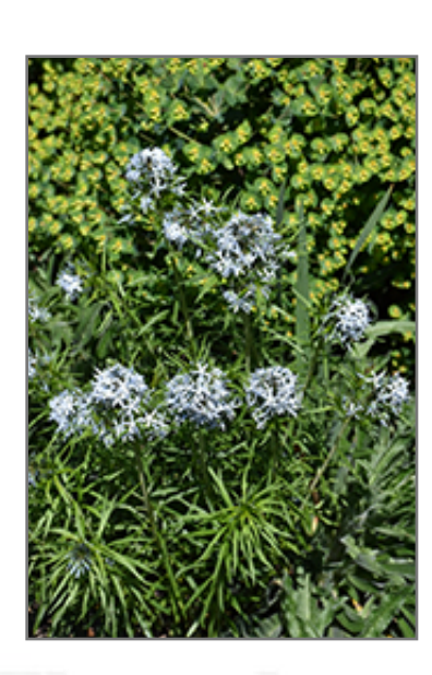
Butterscotch Blue Star flowers

Butterscotch Blue Star has steel blue star-shaped flowers at the ends of the stems from late spring to early summer, which are interesting on close inspection. The flowers are excellent for cutting. Its ferny leaves are green in colour. As an added bonus, the foliage turns gorgeous shades of harvest gold and gold in the fall.