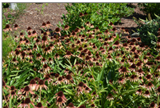
Fiery Meadow Mama Coneflower flowers