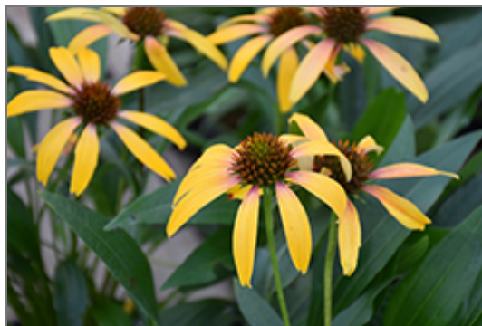
Fiery Meadow Mama Coneflower flowers

This is a relatively low maintenance plant, and is best cleaned up in early spring before it resumes active growth for the season. It is a good choice for attracting butterflies to your yard, but is not particularly attractive to deer who tend to leave it alone in favor of tastier treats. It has no significant negative characteristics.