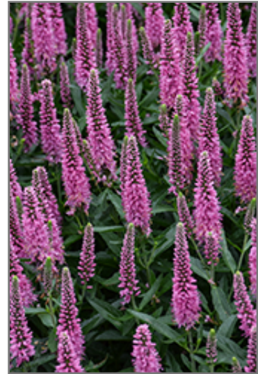
Skyward Pink Long-leaf Speedwell flowers

Skyward Pink Long-leaf Speedwell is recommended for the following landscape applications;