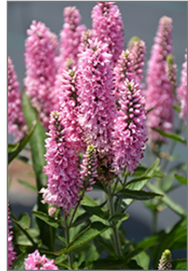
Skyward Pink Long-leaf Speedwell flowers

Skyward Pink Long-leaf Speedwell is a fine choice for the garden, but it is also a good selection for planting in outdoor pots and containers. It is often used as a 'filler' in the 'spiller-thriller-filler' container combination, providing a mass of flowers against which the larger thriller plants stand out. Note that when growing plants in outdoor containers and baskets, they may require more frequent waterings than they would in the yard or garden. Be aware that in our climate, most plants cannot be expected to survive the winter if left in containers outdoors, and this plant is no exception. Contact our experts for more information on how to protect it over the winter months.