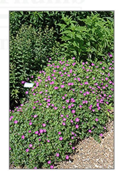
Max Frei Cranesbill in bloom