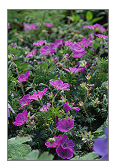
Max Frei Cranesbill flowers

Max Frei Cranesbill is a dense herbaceous perennial with a mounded form. It brings an extremely fine and delicate texture to the garden composition and should be used to full effect.