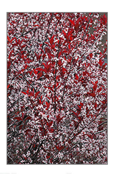
Purpleleaf Sandcherry flowers

This shrub should only be grown in full sunlight. It does best in average to evenly moist conditions, but will not tolerate standing water. It is not particular as to soil type or pH. It is highly tolerant of urban pollution and will even thrive in inner city environments. This particular variety is an interspecific hybrid.