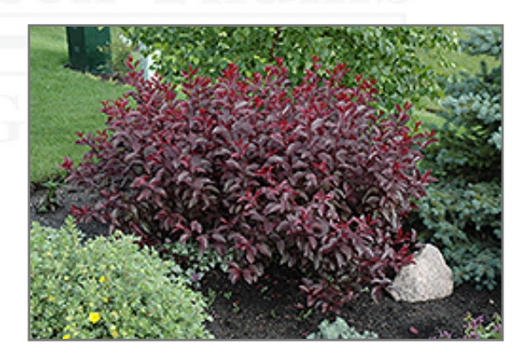
Purpleleaf Sandcherry