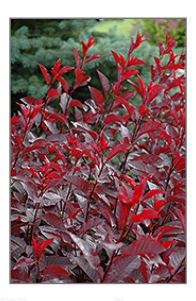
Purpleleaf Sandcherry foliage

Purpleleaf Sandcherry is a multi-stemmed deciduous shrub with an upright spreading habit of growth. Its average texture blends into the landscape, but can be balanced by one or two finer or coarser trees or shrubs for an effective composition.