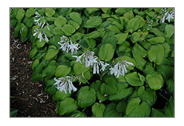
Guacamole Hosta in bloom

Guacamole Hosta will grow to be about 24 inches tall at maturity extending to 3 feet tall with the flowers, with a spread of 4 feet. When grown in masses or used as a bedding plant, individual plants should be spaced approximately 3 feet apart. Its foliage tends to remain dense right to the ground, not requiring facer plants in front. It grows at a medium rate, and under ideal conditions can be expected to live for approximately 10 years. As an herbaceous perennial, this plant will usually die back to the crown each winter, and will regrow from the base each spring. Be careful not to disturb the crown in late winter when it may not be readily seen!