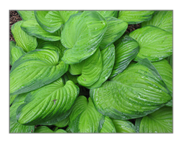
Guacamole Hosta foliage

Guacamole Hosta is a dense herbaceous perennial with tall flower stalks held atop a low mound of foliage. Its relatively coarse texture can be used to stand it apart from other garden plants with finer foliage.