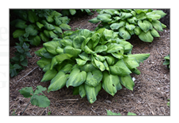
Guacamole Hosta