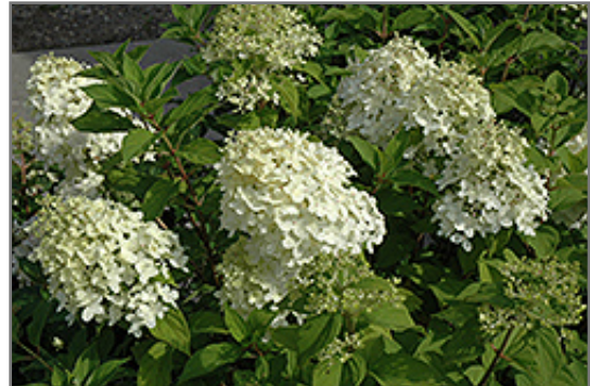
Little Lamb Hydrangea flowers

Little Lamb Hydrangea is recommended for the following landscape applications;