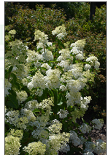
Little Lamb Hydrangea in bloom