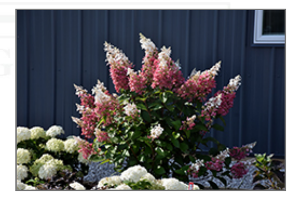
Pinky Winky Hydrangea in bloom