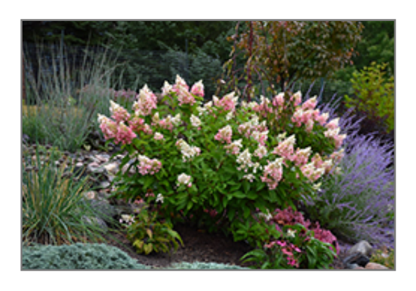
Pinky Winky Hydrangea in bloom

This shrub performs well in both full sun and full shade. It prefers to grow in average to moist conditions, and shouldn't be allowed to dry out. It is not particular as to soil type or pH. It is highly tolerant of urban pollution and will even thrive in inner city environments. Consider applying a thick mulch around the root zone in winter to protect it in exposed locations or colder microclimates. This is a selected variety of a species not originally from North America.