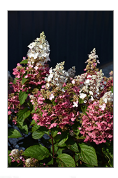
Pinky Winky Hydrangea flowers

Pinky Winky Hydrangea is recommended for the following landscape applications;