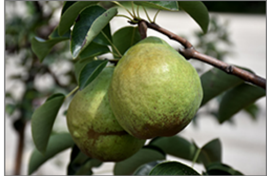
Bartlett Pear fruit