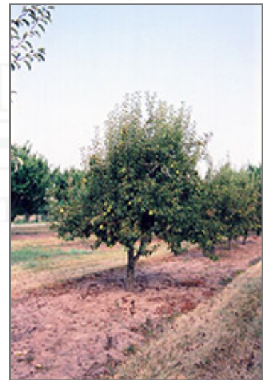
Bartlett Pear