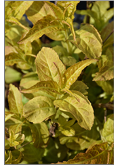
Firefly Diervilla foliage

Firefly Diervilla is recommended for the following landscape applications;