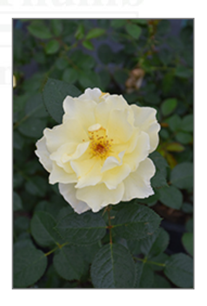
Yukon Sun Rose flowers