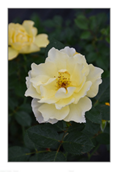
Yukon Sun Rose flowers