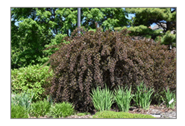
Summer Wine Ninebark

Summer Wine Ninebark is a multi-stemmed deciduous shrub with a more or less rounded form. Its relatively fine texture sets it apart from other landscape plants with less refined foliage.