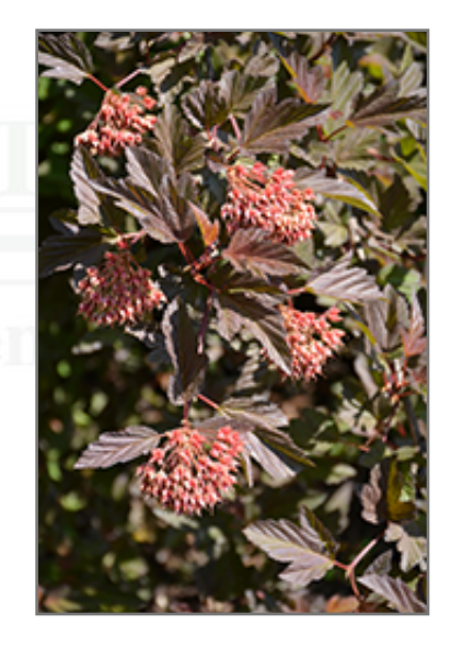
Summer Wine Ninebark flower buds