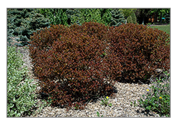
Summer Wine Ninebark

Summer Wine Ninebark will grow to be about 6 feet tall at maturity, with a spread of 6 feet. It has a low canopy, and is suitable for planting under power lines. It grows at a medium rate, and under ideal conditions can be expected to live for approximately 30 years.