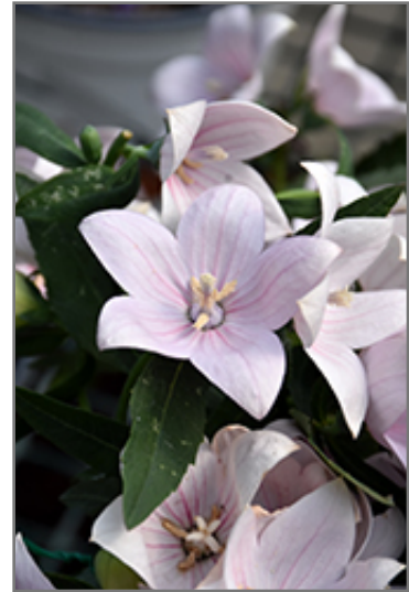
Fuji Pink Balloon Flower flowers

Fuji Pink Balloon Flower has masses of beautiful spikes of shell pink bell-shaped flowers with creamy white eyes and silver veins rising above the foliage from late spring to mid summer, which are most effective when planted in groupings. The flowers are excellent for cutting. Its narrow leaves remain dark green in colour throughout the season.