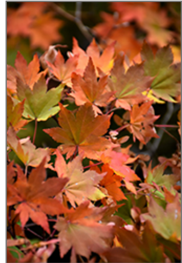
Korean Maple in fall

This tree does best in full sun to partial shade. It prefers to grow in average to moist conditions, and shouldn't be allowed to dry out. It is not particular as to soil type or pH. It is somewhat tolerant of urban pollution, and will benefit from being planted in a relatively sheltered location. Consider applying a thick mulch around the root zone in winter to protect it in exposed locations or colder microclimates. This species is not originally from North America.