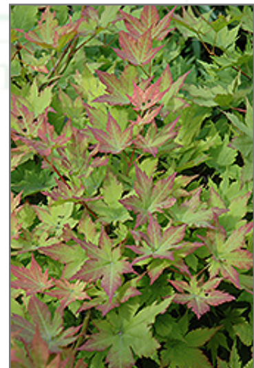
Korean Maple foliage