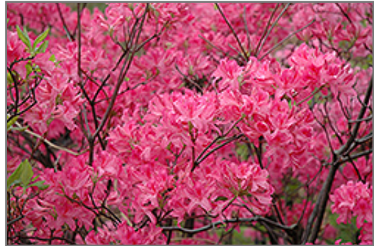
Northern Lights Azalea flowers

Northern Lights Azalea is recommended for the following landscape applications;