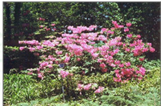
Northern Lights Azalea in bloom