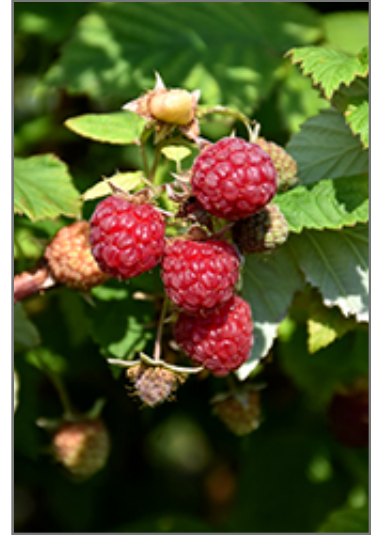
Boyne Raspberry fruit

Boyne Raspberry has rich green deciduous foliage on a plant with an upright spreading habit of growth. The fuzzy oval compound leaves do not develop any appreciable fall colour. It features an abundance of magnificent red berries in mid summer.