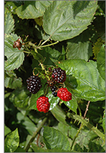
Illini Hardy Blackberry fruit

Illini Hardy Blackberry has rich green deciduous foliage on a plant with an upright spreading habit of growth. The fuzzy oval compound leaves do not develop any appreciable fall colour. It features an abundance of magnificent black berries in mid summer.