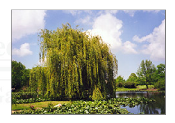
Golden Weeping Willow

This is a high maintenance tree that will require regular care and upkeep, and is best pruned in late winter once the threat of extreme cold has passed. Gardeners should be aware of the following characteristic(s) that may warrant special consideration;