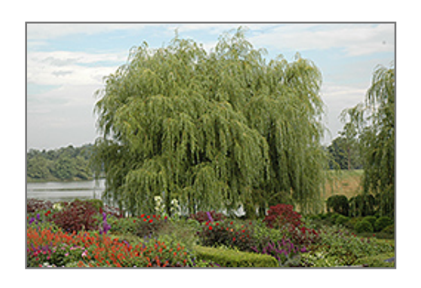
Golden Weeping Willow

Golden Weeping Willow is a dense deciduous tree with a rounded form and gracefully weeping branches. Its relatively fine texture sets it apart from other landscape plants with less refined foliage.