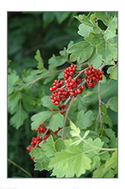
Fragrant Sumac fruit

This shrub will require occasional maintenance and upkeep, and can be pruned at anytime. It is a good choice for attracting butterflies to your yard. Gardeners should be aware of the following characteristic(s) that may warrant special consideration;