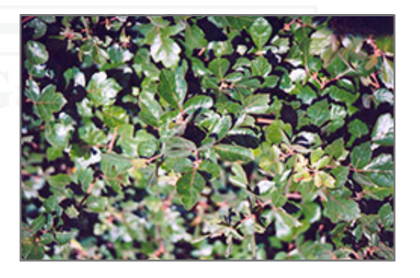
Fragrant Sumac foliage