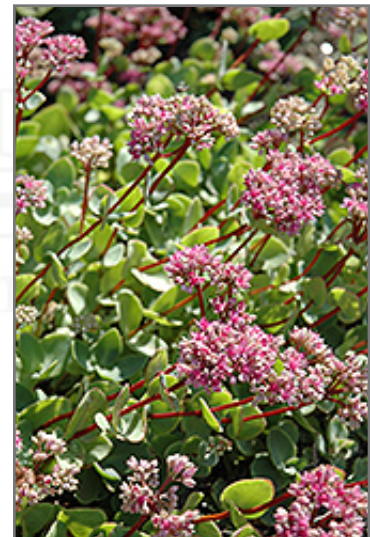
October Daphne flowers