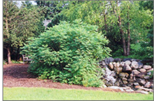
Staghorn Sumac

This shrub does best in full sun to partial shade. It is very adaptable to both dry and moist growing conditions, but will not tolerate any standing water. It is considered to be drought-tolerant, and thus makes an ideal choice for xeriscaping or the moisture-conserving landscape. It is not particular as to soil type or pH. It is highly tolerant of urban pollution and will even thrive in inner city environments. This species is native to parts of North America.