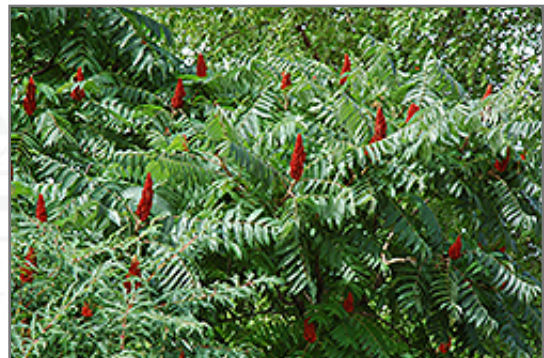
Staghorn Sumac fruit