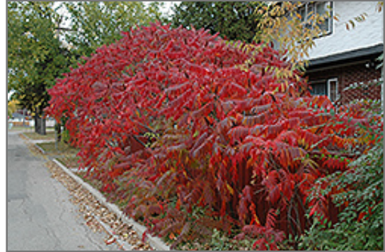
Staghorn Sumac in fall

This is a high maintenance shrub that will require regular care and upkeep, and is best pruned in late winter once the threat of extreme cold has passed. It is a good choice for attracting butterflies to your yard. Gardeners should be aware of the following characteristic(s) that may warrant special consideration;