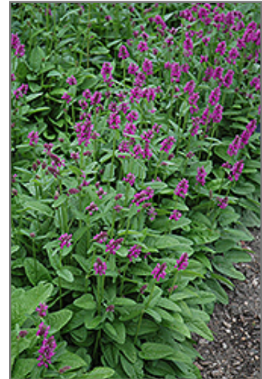
Hummelo Betony in bloom

Hummelo Betony is a dense herbaceous evergreen perennial with tall flower stalks held atop a low mound of foliage. Its medium texture blends into the garden, but can always be balanced by a couple of finer or coarser plants for an effective composition.