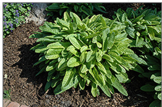
Hummelo Betony