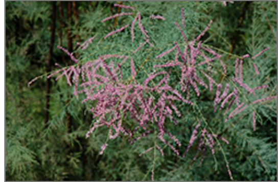
Pink Cascade Tamarisk flowers

Pink Cascade Tamarisk is recommended for the following landscape applications;