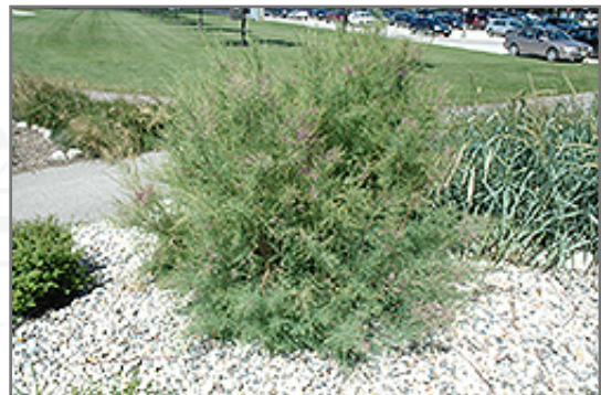
Pink Cascade Tamarisk