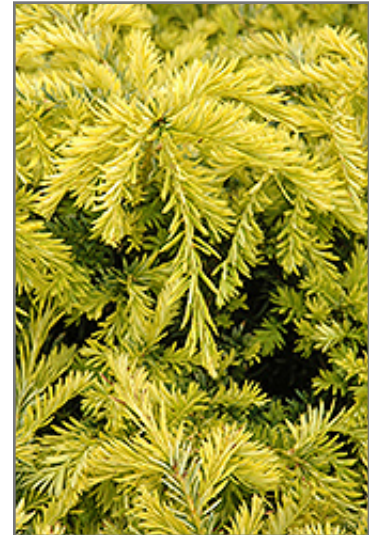
Sunburst Yew foliage