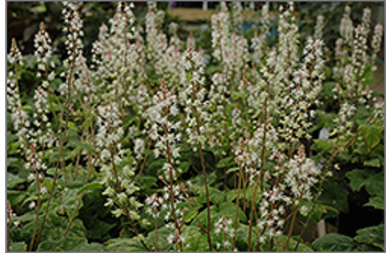
Wherry's Foamflower flowers