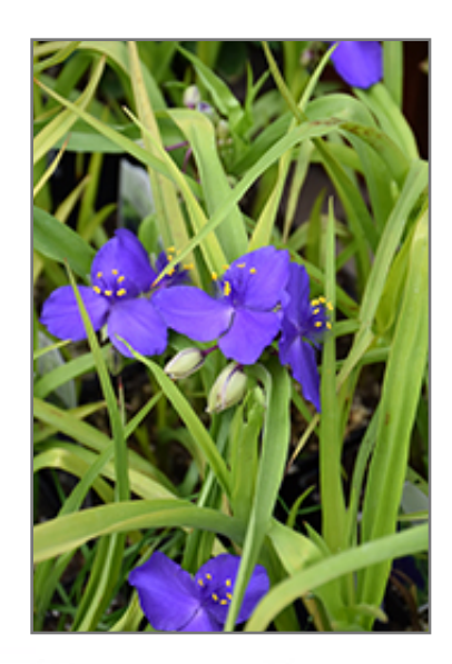
Blue And Gold Spiderwort flowers

Blue And Gold Spiderwort has masses of beautiful clusters of royal blue flowers at the ends of the stems from early to late summer, which are most effective when planted in groupings. Its attractive grassy leaves emerge gold in spring, turning chartreuse in colour throughout the season.