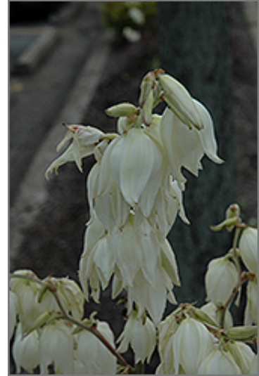
Bright Edge Adam's Needle flowers

Bright Edge Adam's Needle is recommended for the following landscape applications;