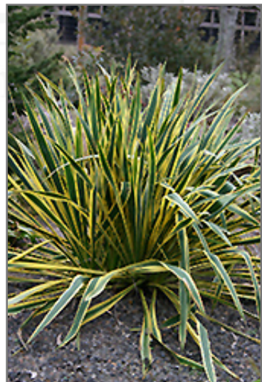
Bright Edge Adam's Needle