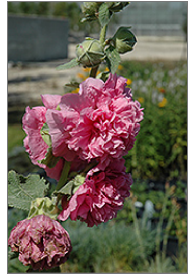
Chater's Double Pink Hollyhock flowers

Chater's Double Pink Hollyhock is recommended for the following landscape applications;