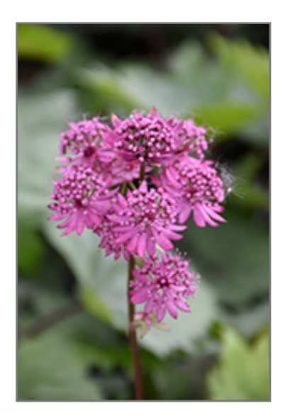
Star Of Beauty Masterwort flowers

Beautiful burgundy pincushion flowers on nearly-black stems with a glowing white center; great on streambanks or in a moist border, doesn't like to dry out; cut back after flowering for a second flush