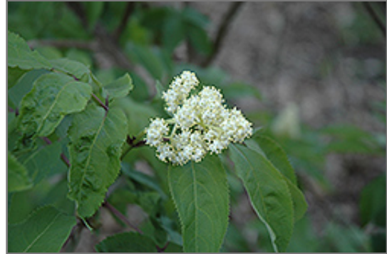
American Elder flowers

American Elder is recommended for the following landscape applications;