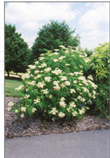
American Elder in bloom