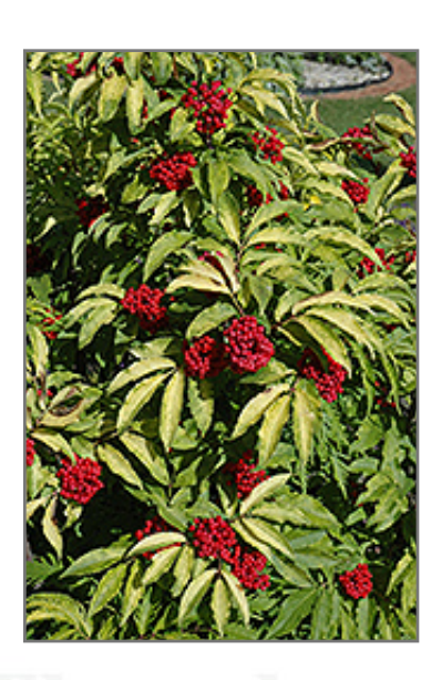
Red Elderberry fruit

Red Elderberry is recommended for the following landscape applications;