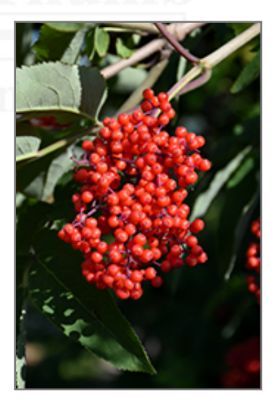
Red Elderberry fruit