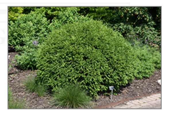
Green Gem Boxwood