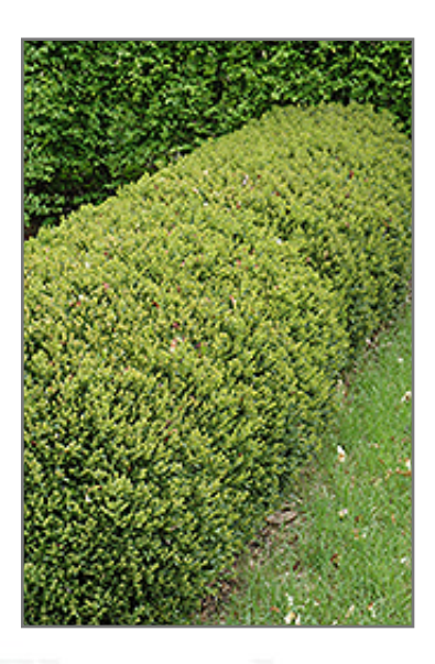
Green Gem Boxwood

Green Gem Boxwood is recommended for the following landscape applications;