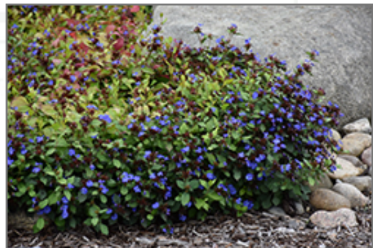
Plumbago in bloom