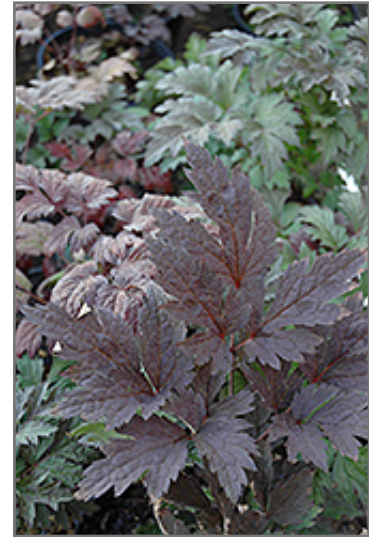
Brunette Bugbane foliage