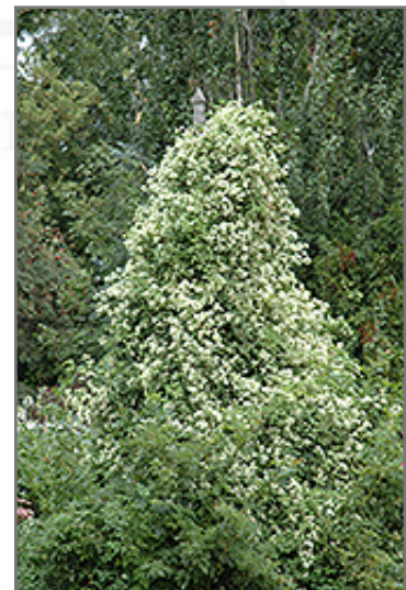
Sweet Autumn Clematis in bloom