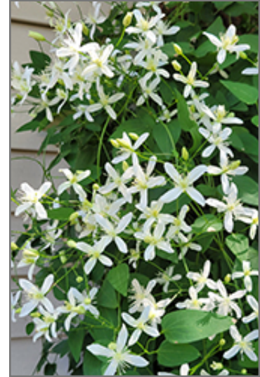
Sweet Autumn Clematis flowers

Sweet Autumn Clematis is recommended for the following landscape applications;