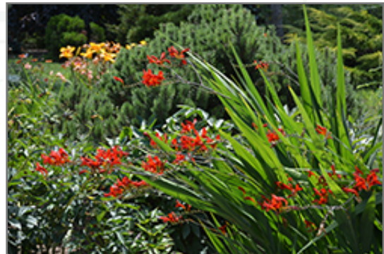
Lucifer Crocosmia in bloom