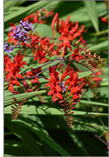
Lucifer Crocosmia flowers

Lucifer Crocosmia is an herbaceous perennial with an upright spreading habit of growth. Its medium texture blends into the garden, but can always be balanced by a couple of finer or coarser plants for an effective composition.