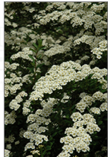
Snowmound Spirea flowers