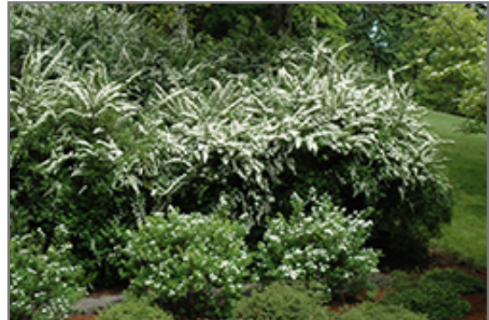
Snowmound Spirea in bloom

Snowmound Spirea is recommended for the following landscape applications;