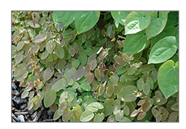
Pink Bishop's Hat foliage

Other Names: Barrenwort, Bishop's Hat, Fairy Wings