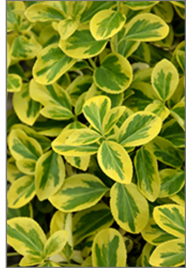
Gold Splash Wintercreeper foliage