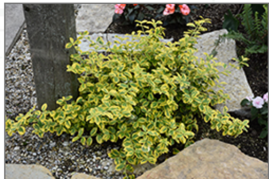
Gold Splash Wintercreeper