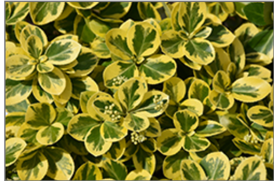
Gold Splash Wintercreeper flower buds

Gold Splash Wintercreeper will grow to be about 24 inches tall at maturity, with a spread of 12 feet. It tends to fill out right to the ground and therefore doesn't necessarily require facer plants in front. It grows at a fast rate, and under ideal conditions can be expected to live for approximately 30 years.