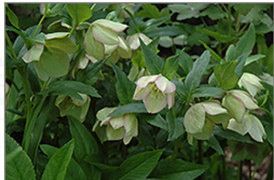
Christmas Rose flowers