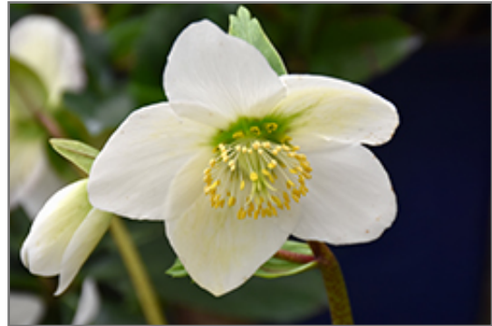
Christmas Rose flowers

Christmas Rose is recommended for the following landscape applications;