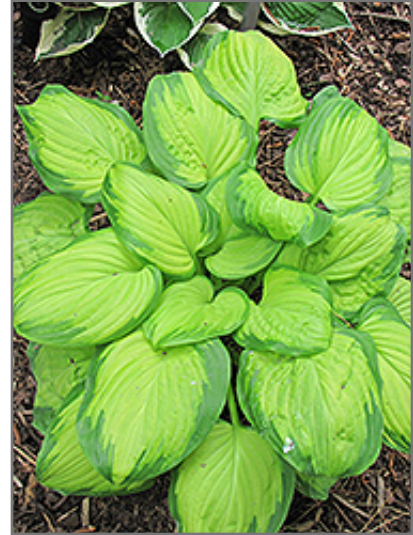
Stained Glass Hosta

Stained Glass Hosta is a dense herbaceous perennial with tall flower stalks held atop a low mound of foliage. Its relatively fine texture sets it apart from other garden plants with less refined foliage.