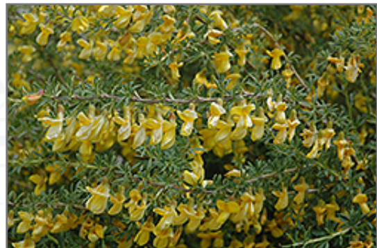
Pygmy Peashrub flowers