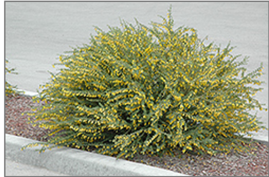
Pygmy Peashrub flowers