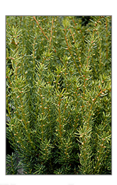
Fairview Yew foliage

Fairview Yew is a dwarf conifer which is primarily valued in the landscape or garden for its ornamental globe-shaped form. It has dark green evergreen foliage which emerges light green in spring. The ferny sprays of foliage remain dark green throughout the winter.